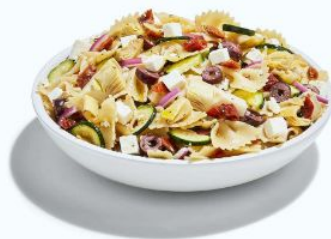
BISTRO Pasta Salad