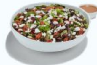
FIELD GREENS, CRANBERRIES & Goat Cheese Salad with Pecans