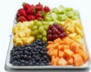
FRUIT Assortment Platter