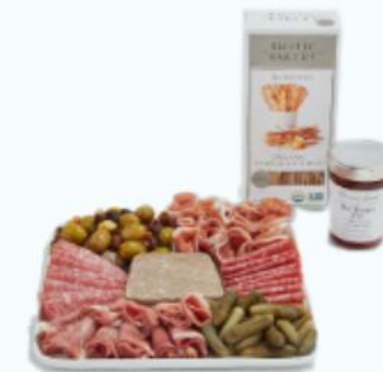
PATE Charcuterie Platter