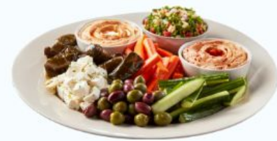
MEDITERRANEAN Mezze Platter (VG)