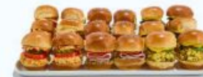
BRIOCHE Slider Platter