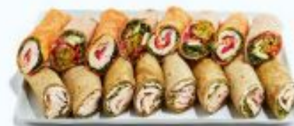
DELICIOUS Wrap Platter