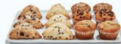
ASSORTED MUFFINS & Scones Platter