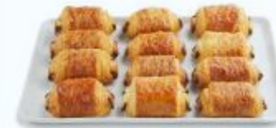
CHOCOLATE Croissant Platter