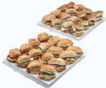
CHEF-CREATED Sandwich Platter