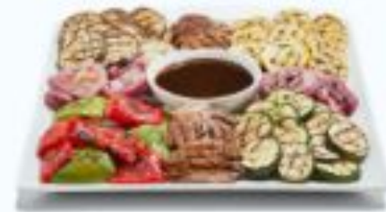
GRILLED Vegetable Platter