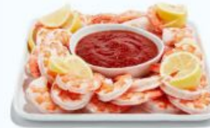
JUMBO Shrimp Platter