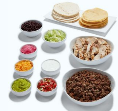
BUILD-YOUR-OWN Taco Bar