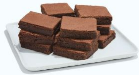
CLASSIC CHOCOLATE Brownies

** All platters serves between 8 - 10 people ** Minimum order $200 ** All orders need to be done 3 days prior to charter ** Any allergies please let us know ** 7% tax will be added to the total