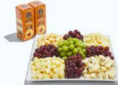
CLASSIC Cheese Platter